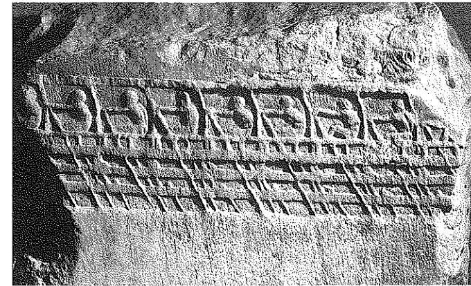
Figure 3.5 The trireme was the preeminent warship at the time of the Persian Wars. Its main aim was to ram and sink opposing warships. Powered by 170 rowers, these ships could achieve over 9 knots for short periods of time. Trireme. The Lenormant relief, ca. 400 B.C.

144. Themistocles had before this given a counsel which prevailed very seasonably. The Athenians, having a large sum of money in their treasury,